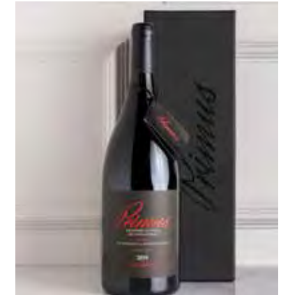
MRS05 • €78.50 PRIMUS 1.5L

The first ever Premium 'Imqadded ta' Malta', wine produced from indigenous Ġellewża & Shiraz grapes.