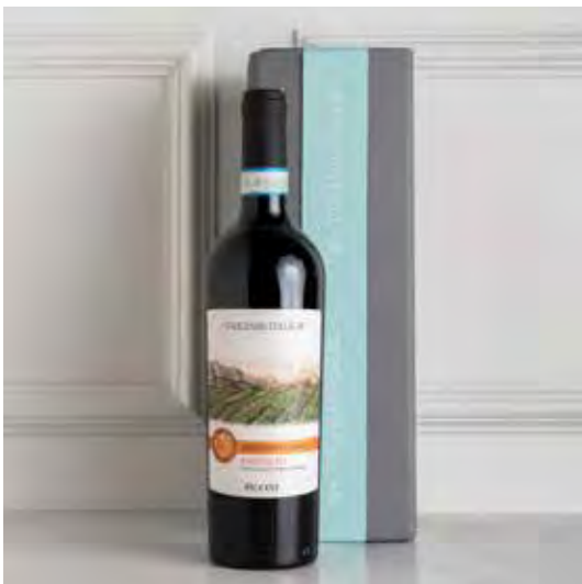
W01 • €10.95

Piccini Origines Italicæ Montepulciano D'Abruzzo 75cl