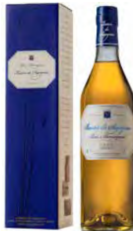
PM02 · €41.25 BARON DE SIGOgnac V.S.O.P. RÉSERVE

VOTED BEST ARTISAN ARMAGNAC DISTILLERY OF 2023