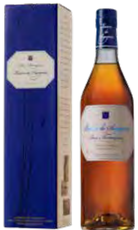
PM03 · €50.80 BARON DE SIGOgnac 10 ANS D'ÂGE EXCELLENCE

VOTED BEST ARTISAN ARMAGNAC DISTILLERY OF 2023