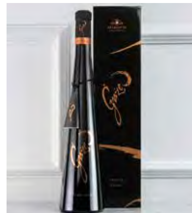
MRS07 • €26.90 ĠUŻE PASSITO 50CL