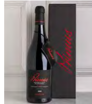
MRS04 • €36.80 PRIMUS 75CL

A bottle of Antonin Noir and a bottle of Marnisi Organic, both produced from Marnisi Estate, Marsaxlokk.