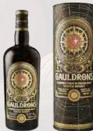
SM05 · €61.25 DOUGLAS LAING'S THE GAULDONS SCOTCH - CAMPBELTOWN Blended Malt Whisky (46.2% ABV)