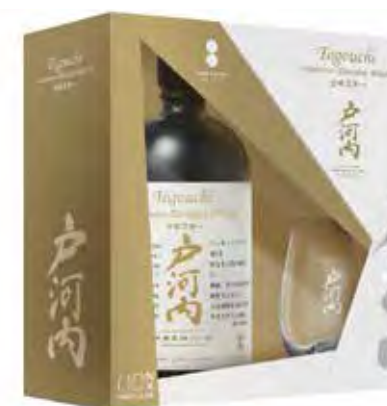
JP03 · €57.75 TOGOUCHI PREMIUM

30% of malted barley, and a 6-month-finish in Sherry Cask, savory notes of vanilla and dried fruits, slightly spicy. Gift pack with 2 glasses.