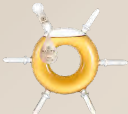
G07 · €69.50 MAZZETTI D'ALTAVILLA