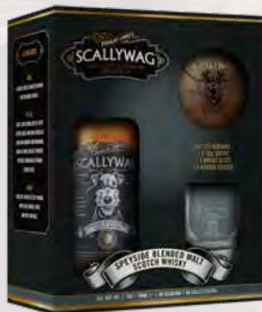
SM04 · €60.00 DOUGLAS LAING'S SCALLYWAG GIFT PACK SCOTCH - SPEYSIDE Blended Malt Whisky (46% ABV)