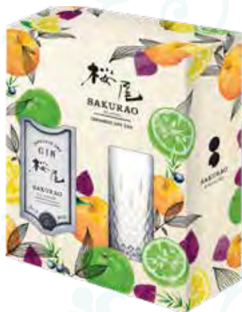
PM05 · €46.00 SAKURAO ORIGINAL JAPANESE GIN PACK