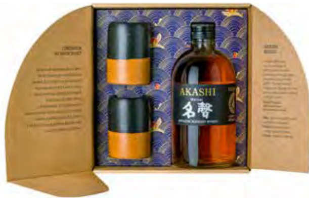
JP01 · €49.50 AKASHI MEISEI

A Japanese blended whisky made from malt and grain. Gift pack with 2 glasses.