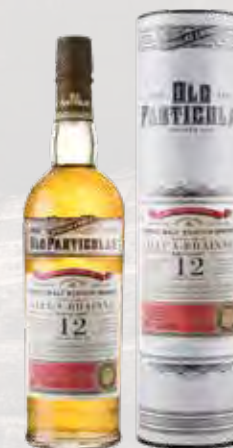
SM06 · €71.60 DOUGLAS LAING'S OLD PARTICULAR 12YR OLD SCOTCH - ALLT-A-BHAINNE Single Malt Whisky (48.4% ABV)