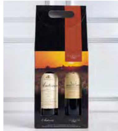
MRS03 • €38.35 ESTATE WINE X2 BTLs

A Selection of Authentic Maltese D.O.K. wines dedicated to the Master with Marsovin wine glass.