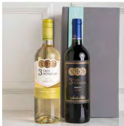
W05 • €19.50

Andes Sauvignon Blanc 75cl, Andes Cabernet Sauvignon 75cl