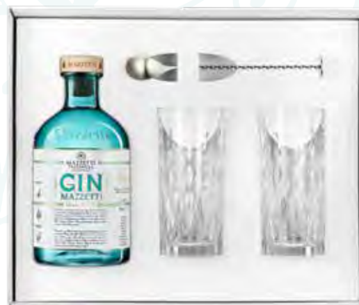
PM09 · €65.00 MAZZETTI D'ALTAVILLA MOMENTO CREATIVO GIN SET 70CL