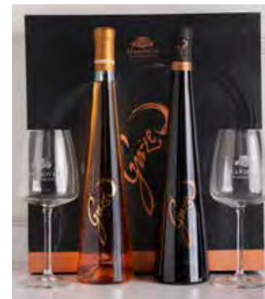
MRS08 • €82.15 ĠUŻE GIFT PACK