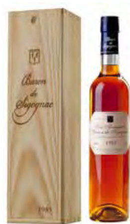
PM04 · €84.60 BARON DE SIGOgnac VINTAGE 1985