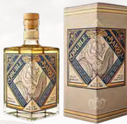
SM02 · €57.20 DOUGLAS LAING'S DOUBLE BARREL SCOTCH - ISLAY & HIGHLAND Blended Malt Whisky (46% ABV)