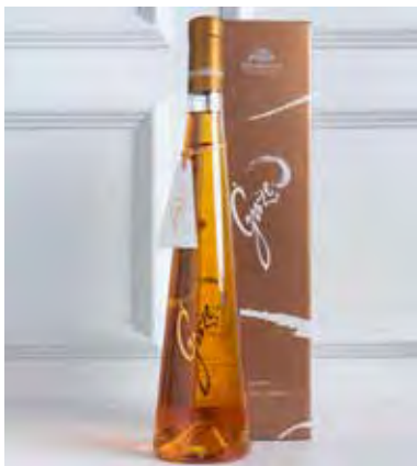
MRS06 • €26.90 ĠUŻE MOSCATO 50CL

The first ever Premium 'Imqadded ta' Malta', wine produced from indigenous Ġellewża & Shiraz grapes.