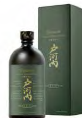
JP06 · €100.00 TOGOUCHI 9 YR OLD

The very first 100% Japanese single malt from the Togouchi range of whiskies. It is specifically matured in a tunnel nestled in the heart of a lush forest.