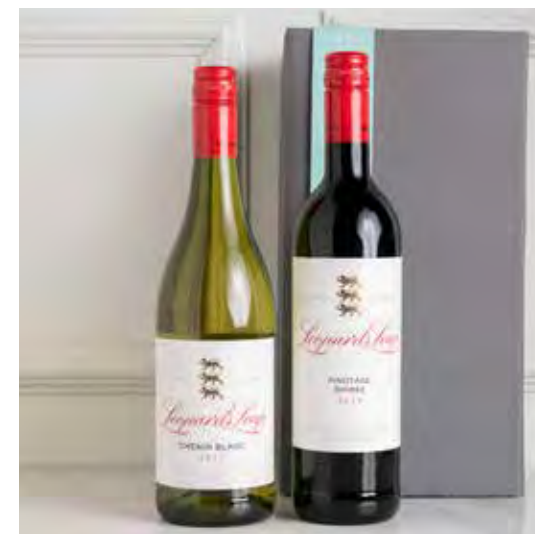
W06 • €24.50

Santa Rita Tres Medallas Sauvignon Blanc 75cl, Santa Rita Tres Medallas Merlot 75cl