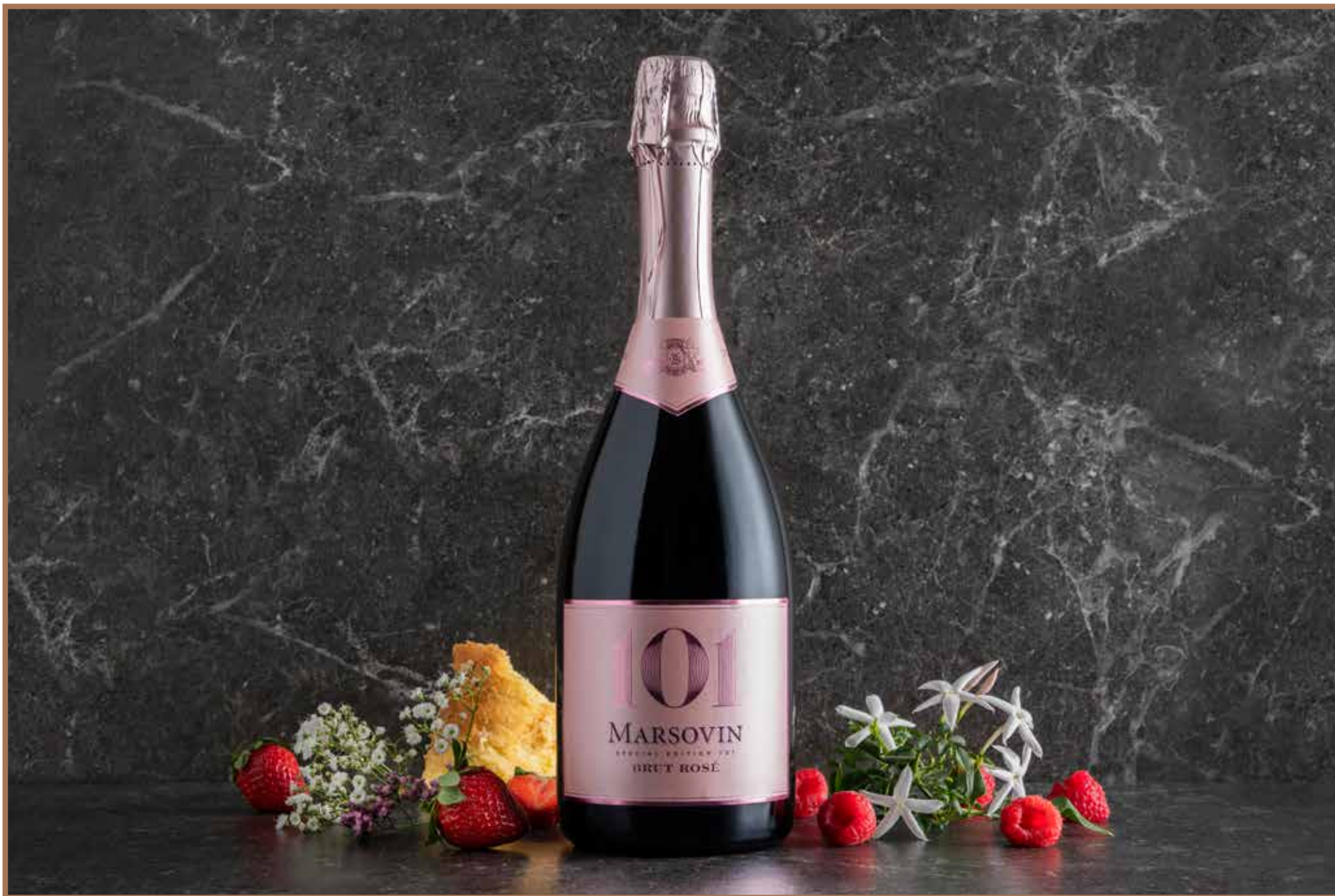
MRS01 • €28.65 101 BRUT ROSÉ