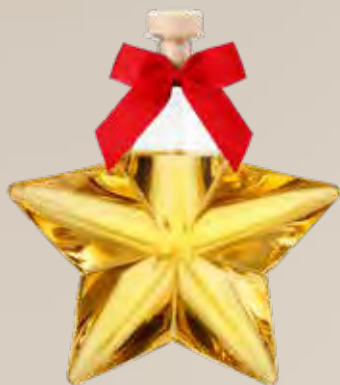
G01 · €29.50 MAZZETTI D'ALTAVILLA

Stella Merry Grappa Grappa Invecchiata [20cl]