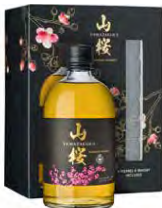
JP04 · €59.00 YAMAZAKURA

A Japanese blended whisky made from malt and grain. Gift pack with 6 whisky stones.