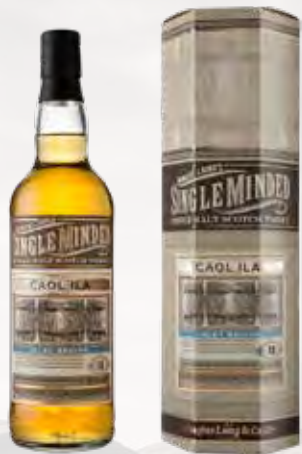
SM01 · €51.85 DOUGLAS LAING'S SINGLE MINDED CAOL ILA 10YR OLD SCOTCH - ISLAY Single Malt Whisky (43% ABV)