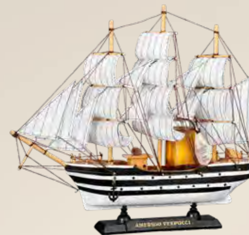
G09 · €87.50 MAZZETTI D'ALTAVILLA

Clessidra in Cornice di Legno Grappa Invecchiata [35cl]