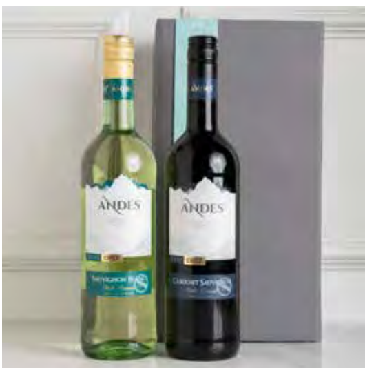
W04 • €16.95

Carson's Chardonnay 75cl, Carson's Cabernet Sauvignon-Shiraz 75cl