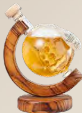
G02 · €39.50 MAZZETTI D'ALTAVILLA

Stella Merry Grappa Grappa Invecchiata [20cl]