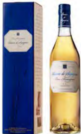
PM01 · €35.95 BARON DE SIGOgnac V.S. SIGNATURE