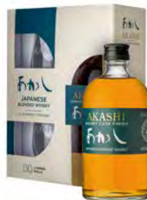
JP02 · €51.40 AKASHI SHERRY CASK

A Japanese blended whisky made from malt and grain. Gift pack with 2 glasses.