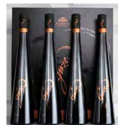
MRS09 • €113.50 ĠUŻE 50CL X4 BTLs