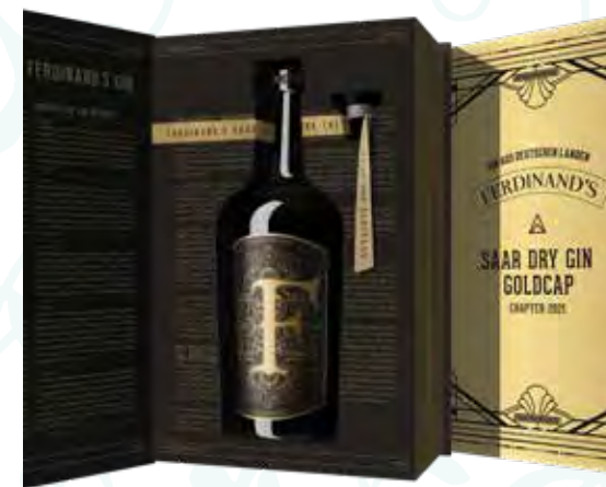
PM10 · €125.00 FERDINAND'S GOLD SAAR DRY GIN