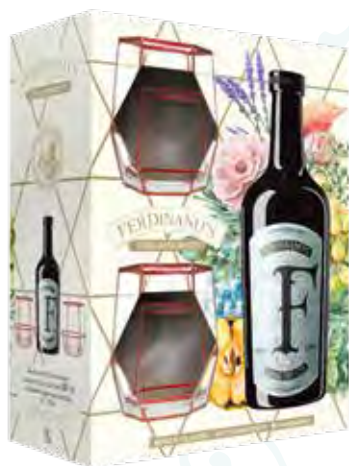
PM08 · €63.00 FERDINAND'S SAAR DRY GIN COPPER COMB SET