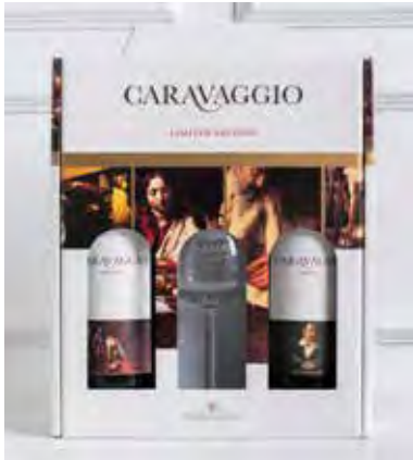
MRS02 • €22.75 CARAVAGGIO GIFT PACK

A Selection of Authentic Maltese D.O.K. wines dedicated to the Master with Marsovin wine glass.