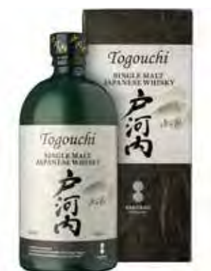
JP05 · €80.50 TOGOUCHI SINGLE MALT

A Japanese blended whisky made from malt and grain. Gift pack with 6 whisky stones.