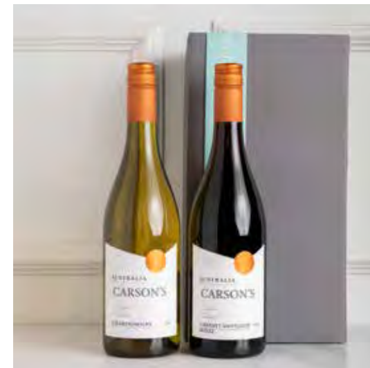
W03 • €15.95

Carson's Chardonnay 75cl, Carson's Cabernet Sauvignon-Shiraz 75cl