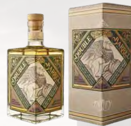
SM03 · €57.20 DOUGLAS LAING'S DOUBLE BARREL SCOTCH - SPEYSIDE & LOWLAND Blended Malt Whisky (46% ABV)