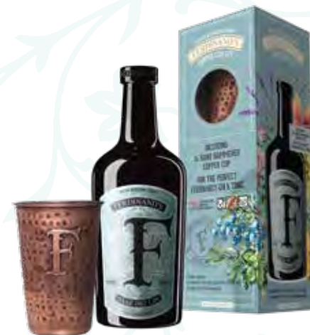
PM07 · €62.00 FERDINAND'S SAAR DRY GIN COPPER CUP SET