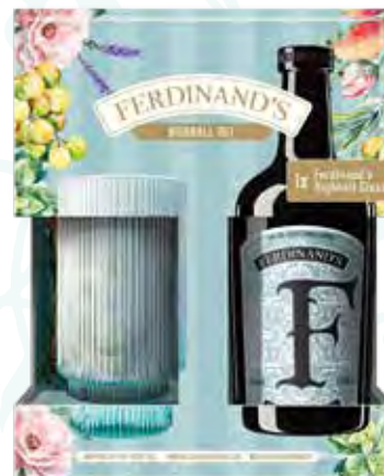
PM06 · €57.50 FERDINAND'S SAAR DRY GIN SET