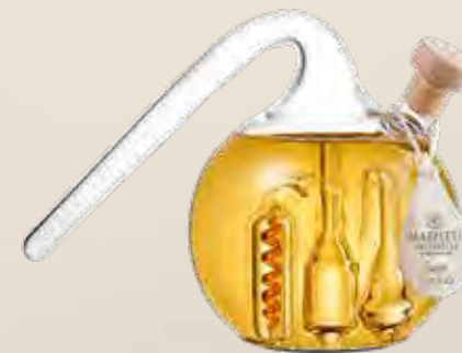
G03 · €49.50 MAZZETTI D'ALTAVILLA

Mappamondo con Nave Grappa Invecchiata [20cl]