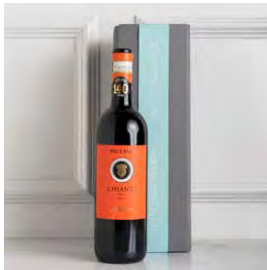
W02 • €12.95

Piccini Origines Italicæ Montepulciano D'Abruzzo 75cl