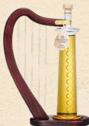
G05 · €60.00 MAZZETTI D'ALTAVILLA