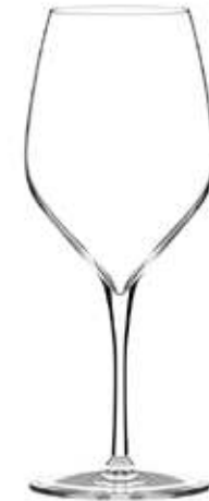
A03 • €39.75

Italesse Vertical Large 500cc (Box by 6)