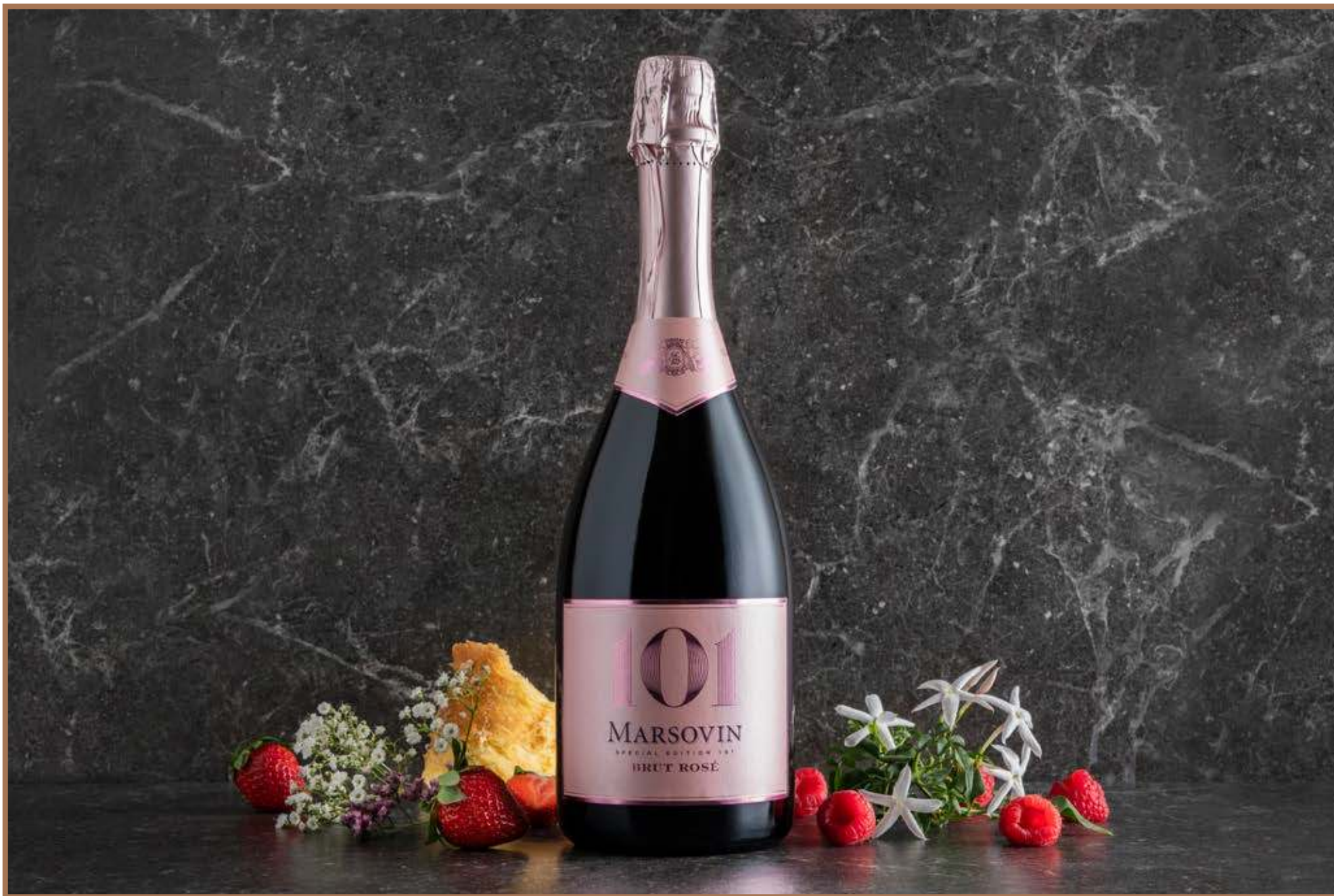
MRS01 • €28.65 101 BRUT ROSÉ