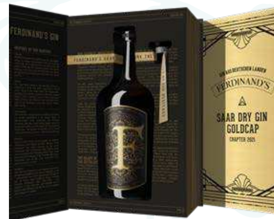
PM09 · €125.00 FERDINAND'S GOLD SAAR DRY GIN