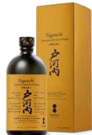
JP05 · €60.00 TOGOUCHI BEER CASK

A Japanese blended whisky made from malt and grain. Gift pack with 2 glasses.