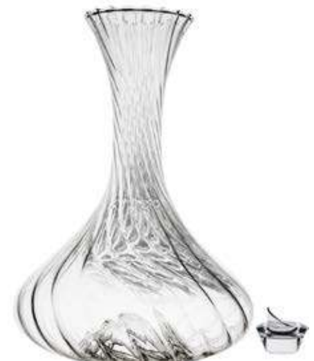
A06 • €58.00