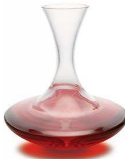
A05 • €57.00