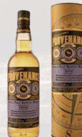
SM06 · €65.50 DOUGLAS LAING'S PROVENANCE AARAN 8YR OLD SCOTCH - HIGHLAND Single Malt Whisky (46% ABV)