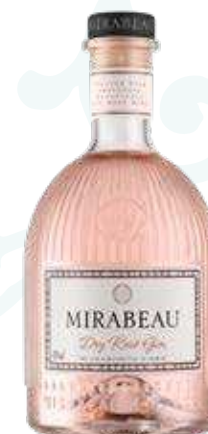
PM10 · €45.00 MIRABEAU ROSÉ GIN 70CL