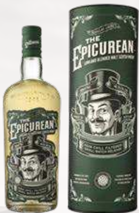
SM01 · €43.40 DOUGLAS LAING'S THE EPICUREAN SCOTCH - LOWLAND Blended Malt Whisky (46% ABV)