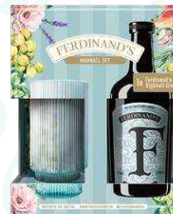
PM06 · €57.50 FERDINAND'S SAAR DRY GIN SET