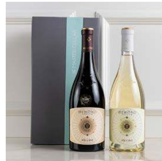
W03 • €22.95

Broken Back Semillion Chardonnay 75cl, Broken Back Shiraz 75cl