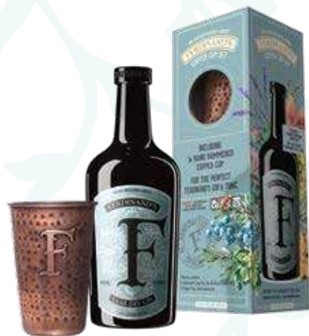
PM07 · €62.00 FERDINAND'S SAAR DRY GIN COPPER CUP SET