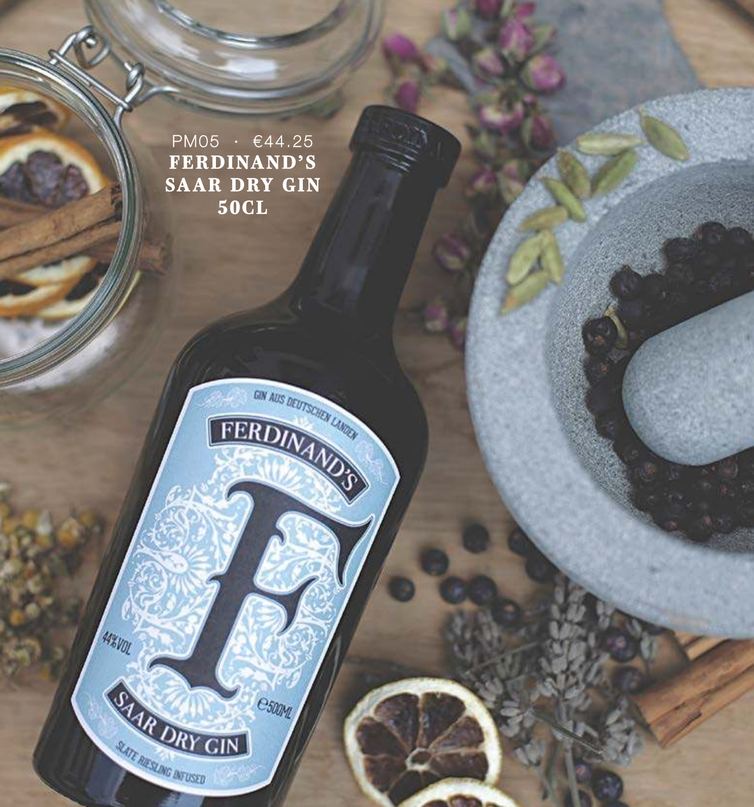
PM05 · €44.25 FERDINAND'S SAAR DRY GIN 50CL