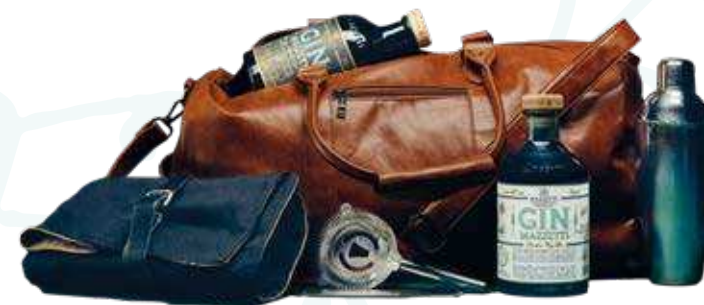
PM13 · €190.00 MAZZETTI D'ALTAVILLA WEEKEND SET GIN MAZZETTI