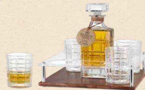
G12 · €120.00 MAZZETTI D'ALTAVILLA

Amerigo Vespucci Grappa Invecchiata [10cl]