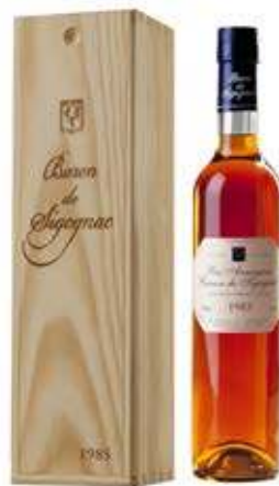
PM04 · €84.60 BARON DE SIGOgnac VINTAGE 1985