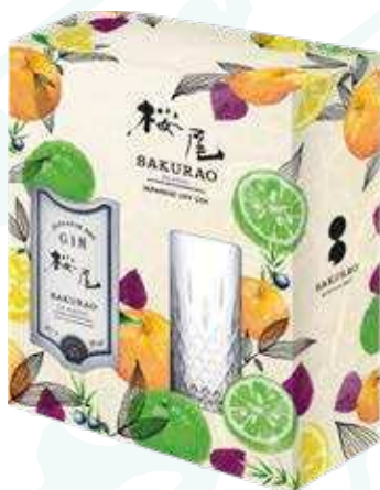
PM11 · €46.00 SAKURAO ORIGINAL JAPANESE GIN PACK