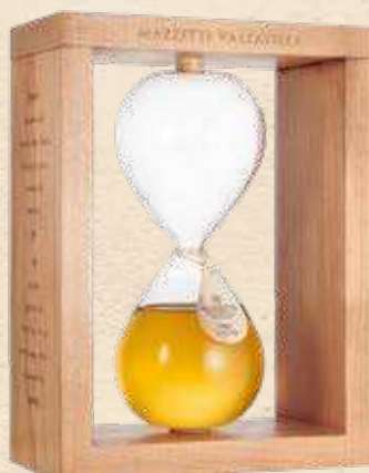
G10 · €75.00 MAZZETTI D'ALTAVILLA

Clessidra in Cornice di Legno Grappa Invecchiata [35cl]