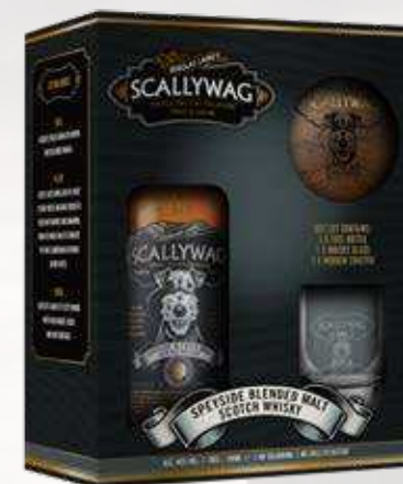
SM03 · €60.00 DOUGLAS LAING'S SCALLYWAG GIFT PACK SCOTCH - SPEYSIDE Blended Malt Whisky (46% ABV)