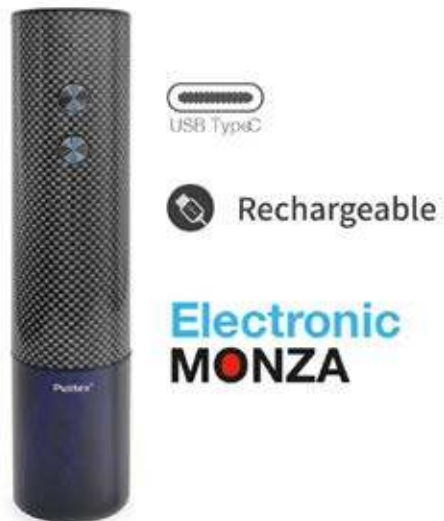
A04 • €45.00

Italesse Vertical Large 500cc (Box by 6)