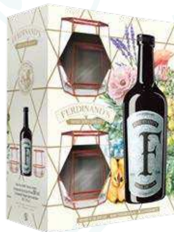
PM08 · €63.00 FERDINAND'S SAAR DRY GIN COPPER COMB SET