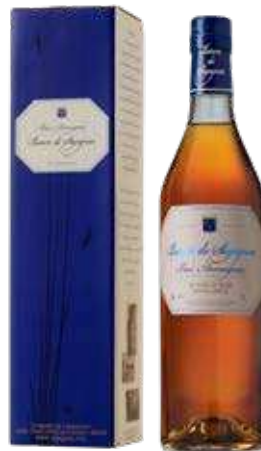
PM02 · €50.80 BARON DE SIGOgnac 10 ANS D'ÂGE EXCELLENCE

VOTED BEST ARTISAN ARMAGNAC DISTILLERY OF 2023