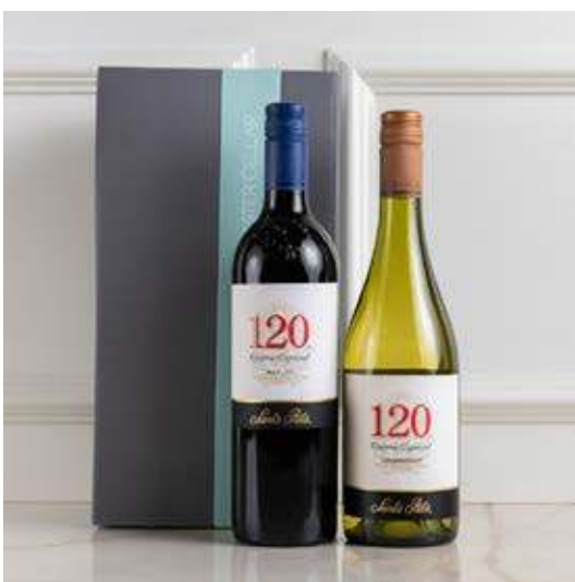
W04 • €24.50

Piccini Memoro Bianco 75cl, Piccini Memoro Rosso 75cl