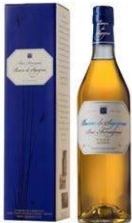
PM01 · €41.25 BARON DE SIGOgnac V.S.O.P. RÉSERVE