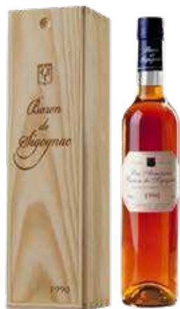
PM03 · €66.60 BARON DE SIGOgnac VINTAGE 1990

VOTED BEST ARTISAN ARMAGNAC DISTILLERY OF 2023