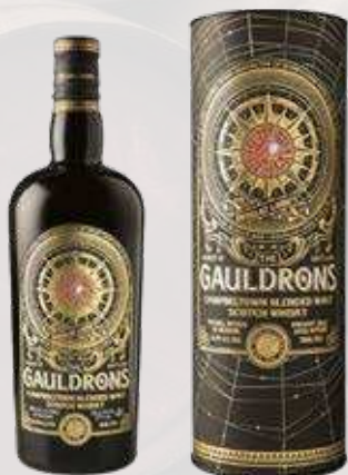
SM04 · €61.25 DOUGLAS LAING'S THE GAULDRENS SCOTCH - CAMPBELTOWN Blended Malt Whisky (46.2% ABV)