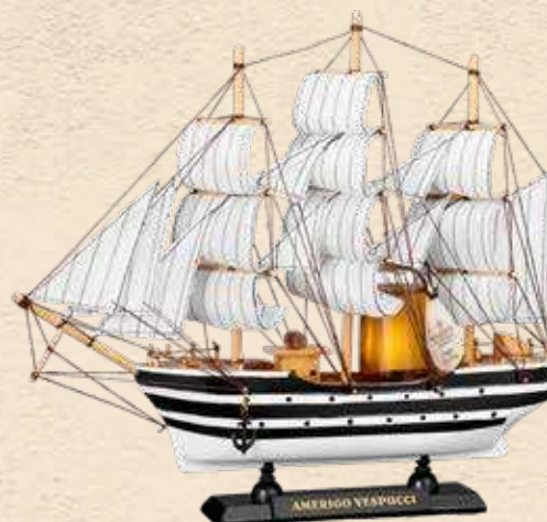
G11 · €87.50 MAZZETTI D'ALTAVILLA

Clessidra in Cornice di Legno Grappa Invecchiata [35cl]