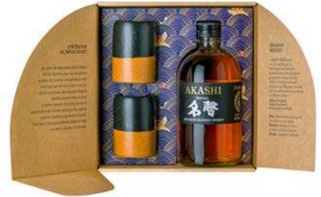
JP01 · €49.50 AKASHI MEISEI

In Japan, however, the industry is vertically integrated, meaning whisky companies own both the distilleries and the brands of blended whiskies, and do not trade with their competitors. So, a blended whisky in Japan will generally only contain malt whisky from the distilleries owned by that same company, creating a unique flavour profile.