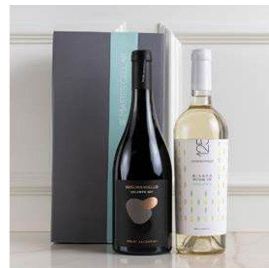
W06 • €30.00

Château Nicot Blanc 75cl, Château Nicot Rouge 75cl