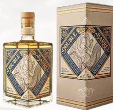
SM02 · €58.50 DOUGLAS LAING'S DOUBLE BARREL SCOTCH - ISLAY & HIGHLAND Blended Malt Whisky (46% ABV)