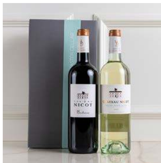
W05 • €27.95

Santa Rita 120 Chardonnay 75cl, Santa Rita 120 Merlot 75cl