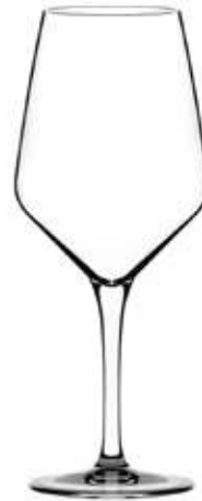
A02 • €29.50

Mazetti D'Altavilla Alki & Mia Candles (Price per Candle)