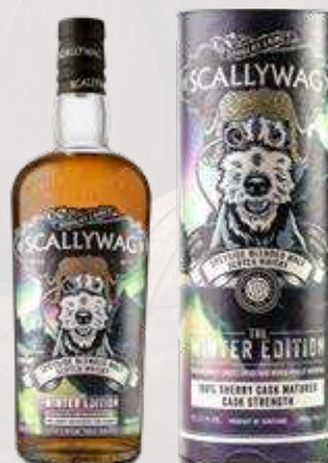
SM05 · €65.20 DOUGLAS LAING'S SCALLYWAG WINTER EDITION SCOTCH - SPEYSIDE Blended Malt Whisky (52.5% ABV)