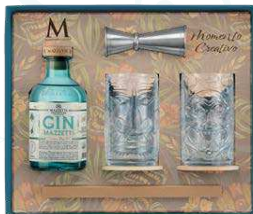
PM12 · €70.00 MAZZETTI D'ALTAVILLA MOMENTO CREATIVO GIN SET 70CL