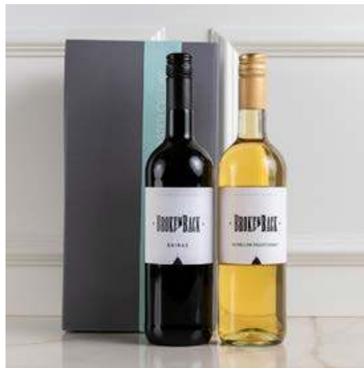
W02 • €19.50

Piccini Origines Italicæ Montepulciano D'Abbruzzo 75cl, La Fleur Pinot Grigio 75cl