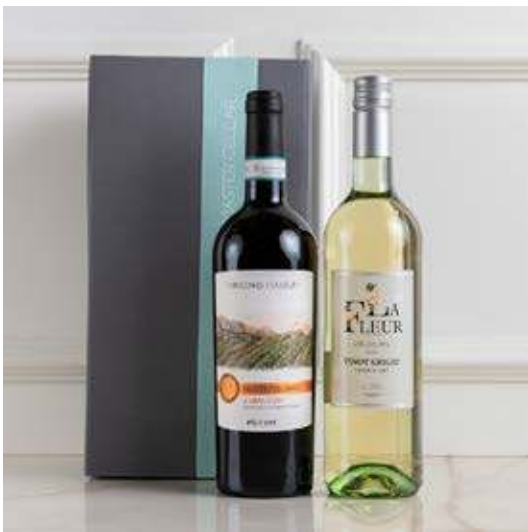
W01 • €15.00

Piccini Origines Italicæ Montepulciano D'Abbruzzo 75cl, La Fleur Pinot Grigio 75cl