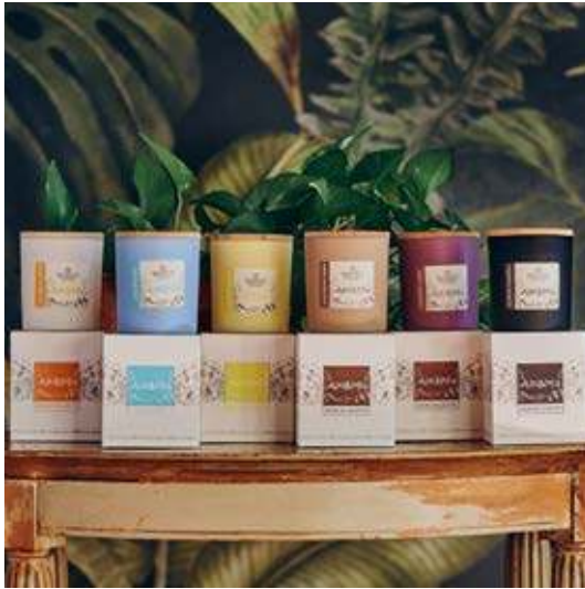
A01 • €13.95

Mazetti D'Altavilla Alki & Mia Candles (Price per Candle)