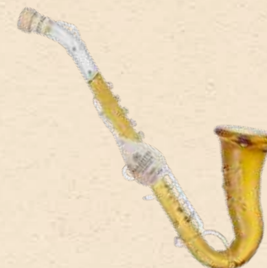
G06 · €65.00 MAZZETTI D'ALTAVILLA