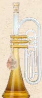
G04 · €60.00 MAZZETTI D'ALTAVILLA